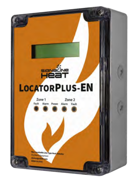
FT-68-EN is to be used with the Signaline LocatorPlus-EN and the Signaline FT-EOL-EN

Tel: +44(0)1252 725257 Email: sales@lgmproducts.com